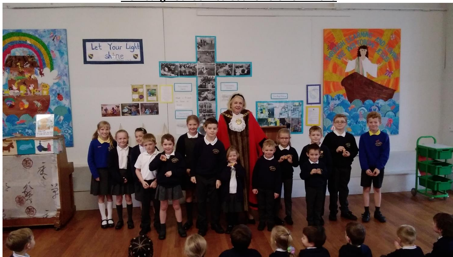
Newburgh School Council 2022-2023