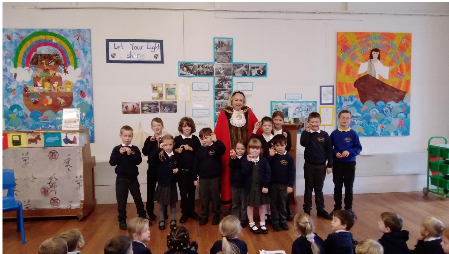
Newburgh School Eco Councillors 2022-2023